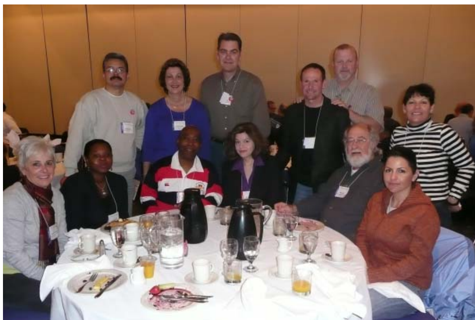
FA, AFT 6157 Delegates attend the CFT Convention in Sacramento

At the end of the luncheon it was clear a great time had been had by all. And hopefully in the hearts and minds of those children the goal of obtaining a college education and a professional career seemed more real and if we all keep our promise to be good role models, more achievable.