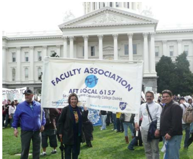
FA, AFT 6157 Faculty and Students at the March In March at the Capitol