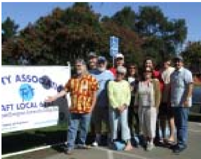
The FA, AFT 6157 Executive Board & Ex Officio