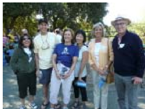
This is too much fun!