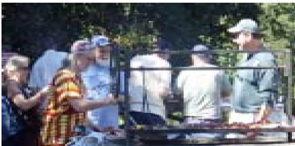
The team of Chefs and their trusty assistants